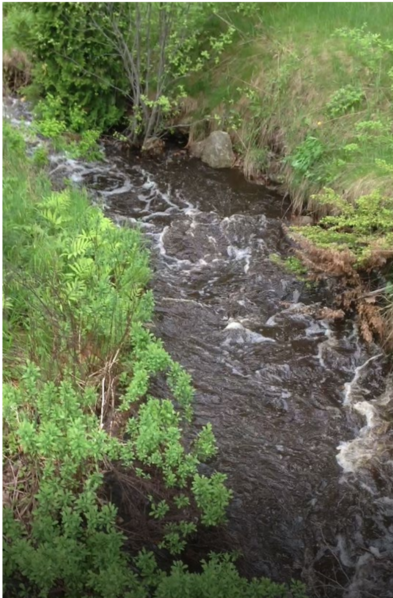
Langley Brook, Laconia, NH